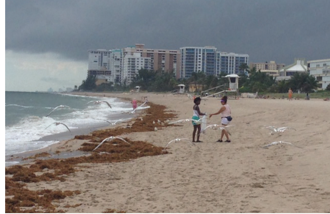
Students collected 31 pounds of trash.

"This is another way I think as a professor we can involve students...what they do gets