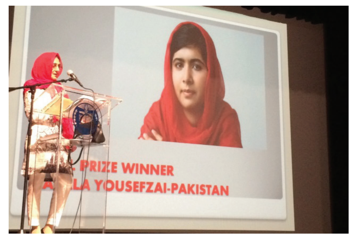
The Music, Film, Literature Art event showed students inspiring work.

She fought her mother on this topic and went hungry to prove her dedication until