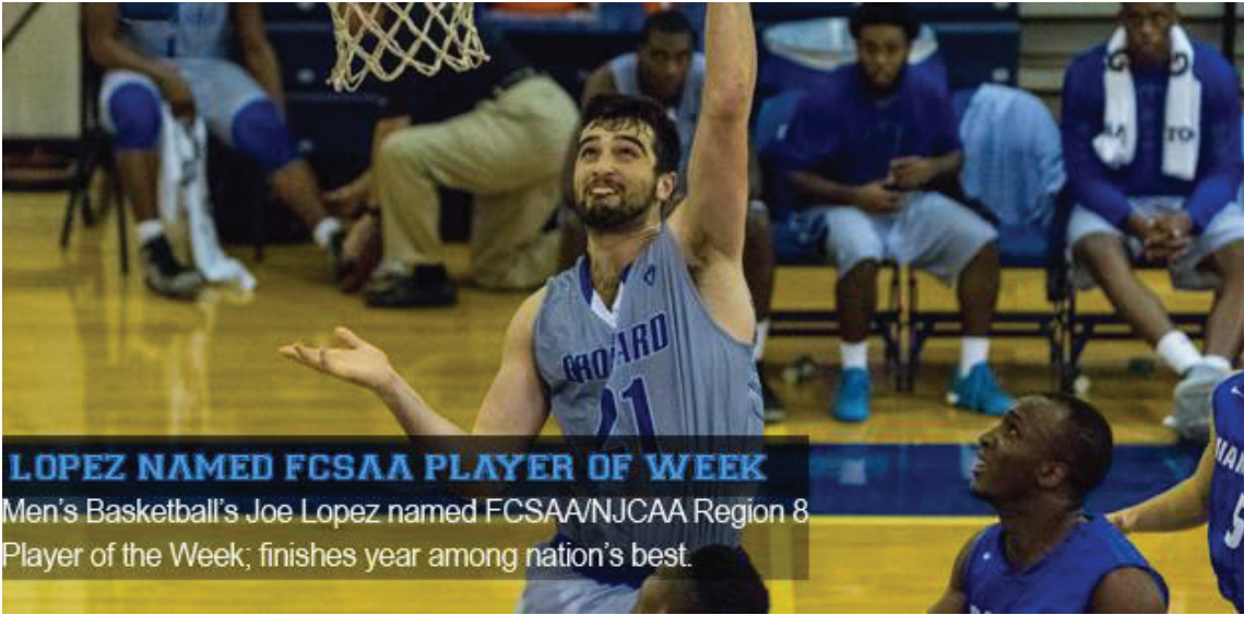
Broward College is constantly posting updates on their website.