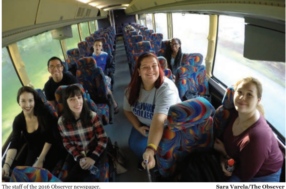
The staff of the 2016 Observer newspaper.

Now that I am leaving and passing the throne down