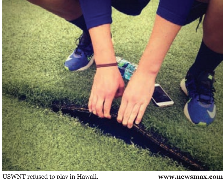
USWNT refused to play in Hawaii.

The US Men's National Team (USMNT) has never won a World Cup. Their