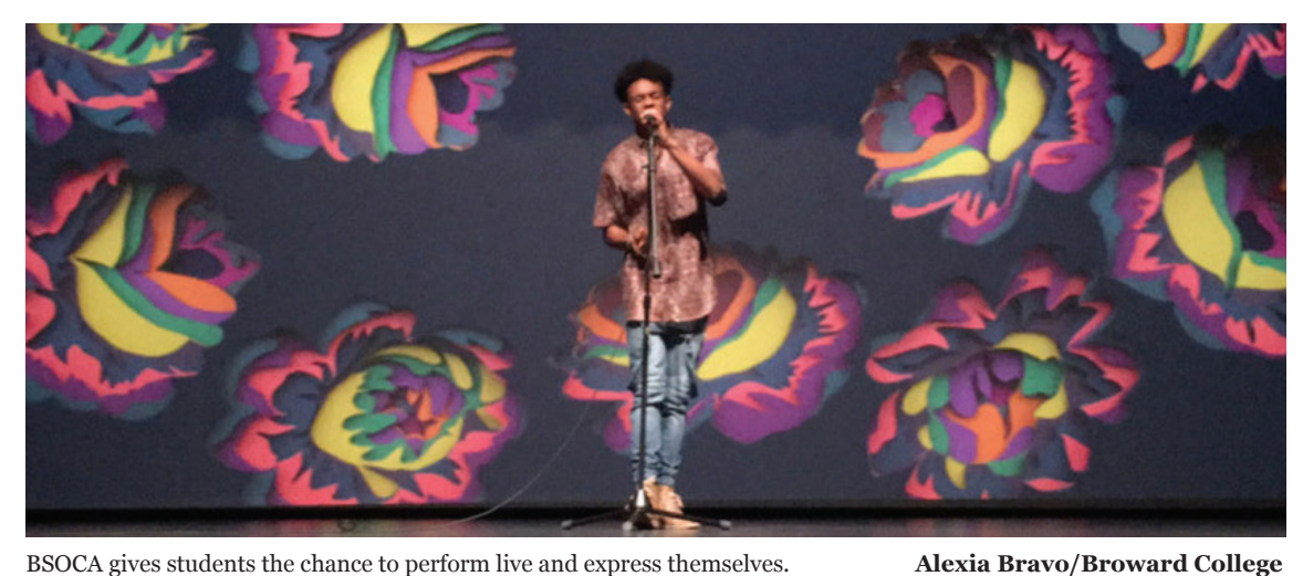
BSOCA gives students the chance to perform live and express themselves.

Currently, BSOCA hosts a plethora of events that focus on creativity, art and theater all the while keeping everything