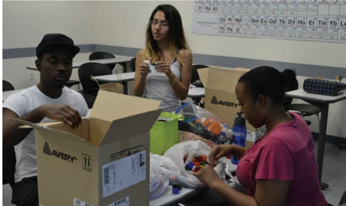
The club volunteers with organizations such as Caps of Love.

"We like to join in and help out different organizations. I feel that is just as important as being in the club. You can't be in the club just for the title, you have to contribute," said