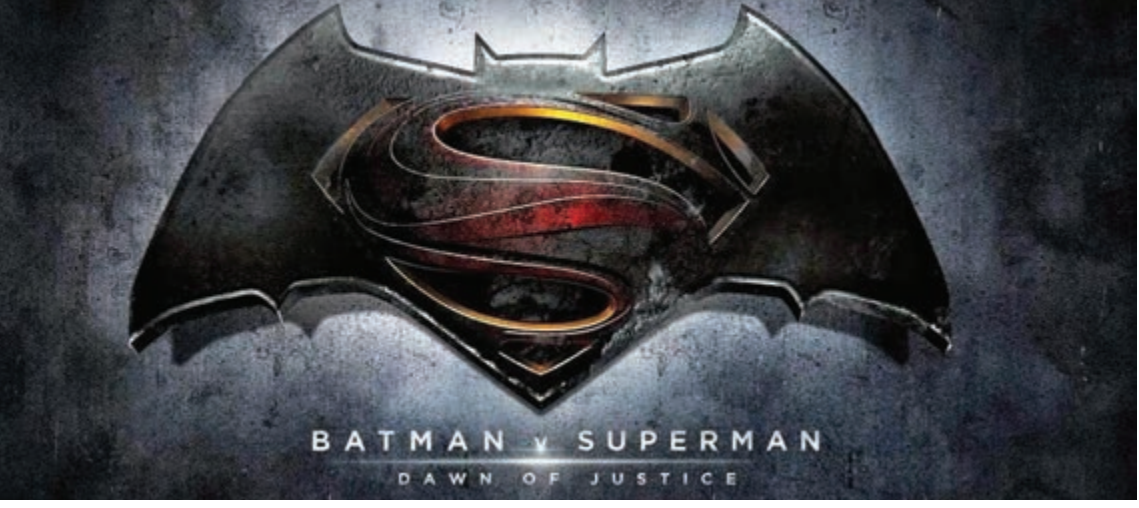
Batman v. Superman had a successful turnout.

On the bright side of things, it does give a compelling story of how Batman and Superman became rivals and how the Justice League will emerge. The movie is over 3 hours long so you definitely get your money's worth for a comic book movie. And, the action and special effects are phenomenal; it is a must see.