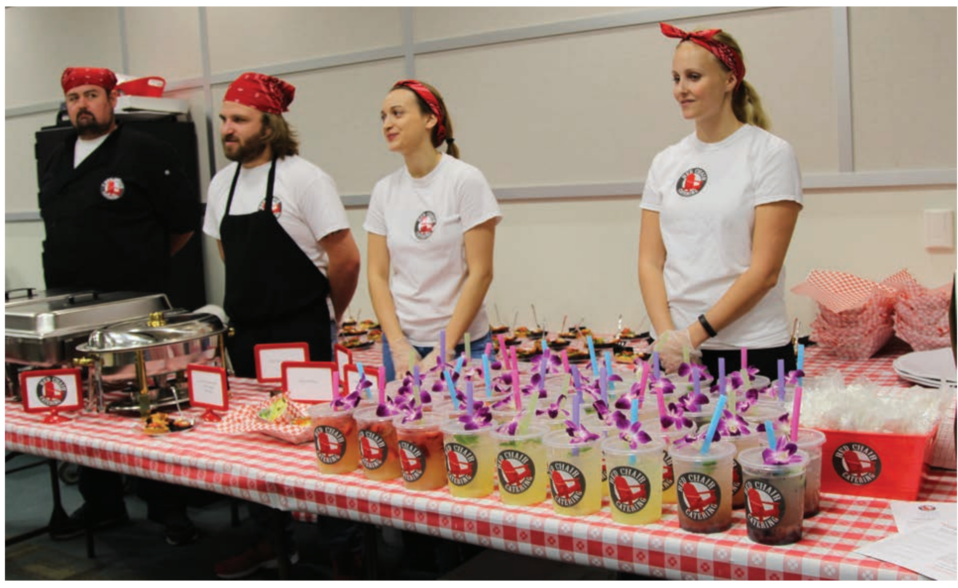
Broward College welcomed local cooks for a competition.