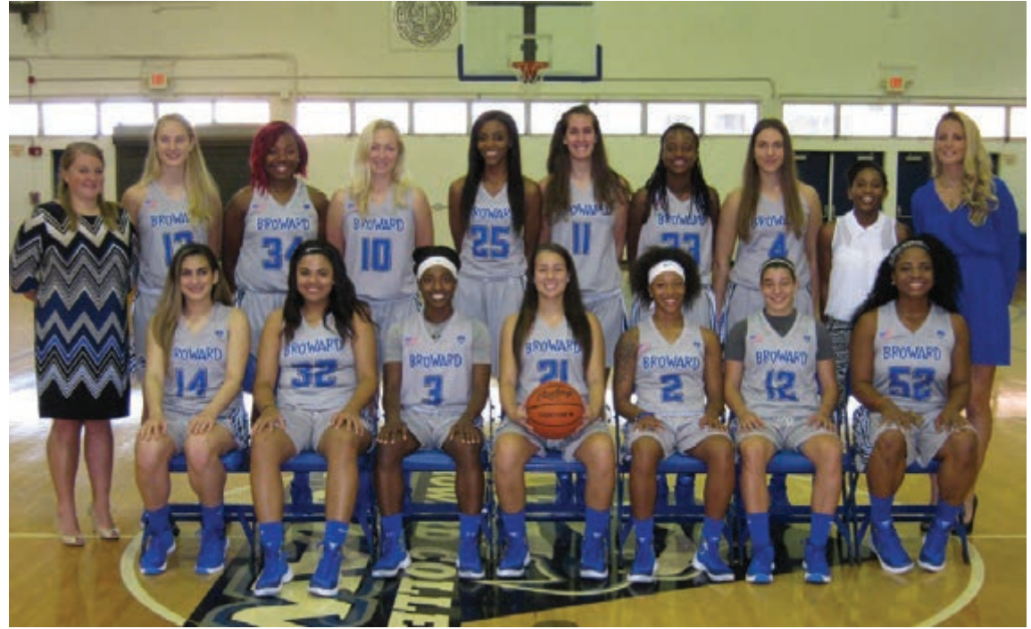
The women's basketball team had a season to be proud of.

"The team's previous loss fueled our passion and purpose for this year. In addition, we were able to recruit key players on our team that we were missing last year," said