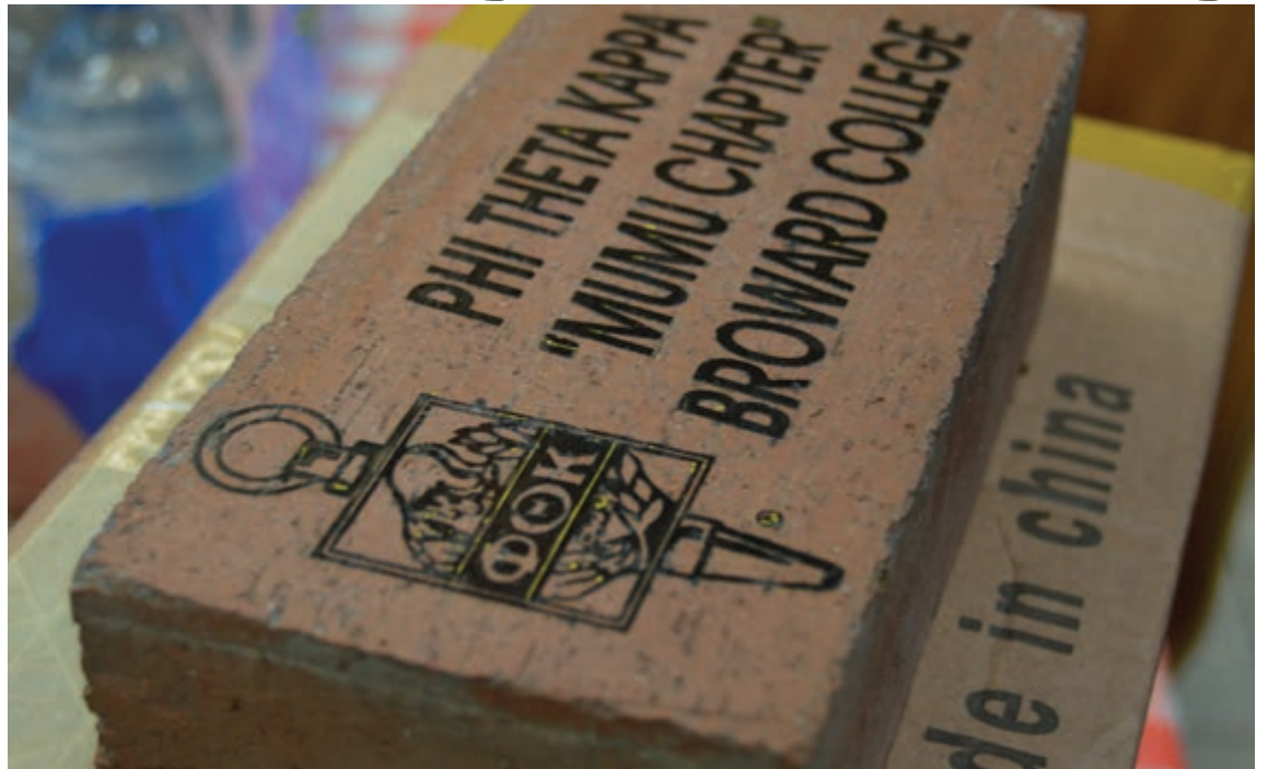
Dr. King was honored in an event that fundraised $96,406 for the community.