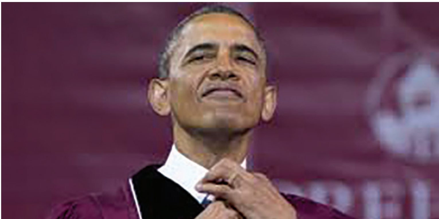
Obama may be implementing a new act that allows students to receive two free years of community college.

This proposal is supposed to help the country as a whole, somehow. It takes money to make money, and giving adults the opportunity to go to school to get an education and be able