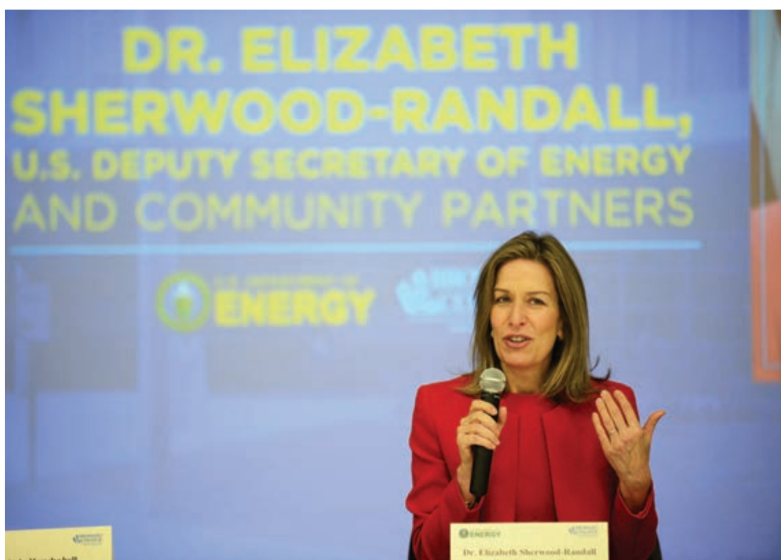
Dr. Elizabeth Sherwood-Randall, U.S. Deputy Secretary of Energy speaks to BC students, faculty and staff at North Campus on Jan. 8.

Dr. Sherwood-Randall said that if she had the chance to do this all over again, she would still be interested in developing