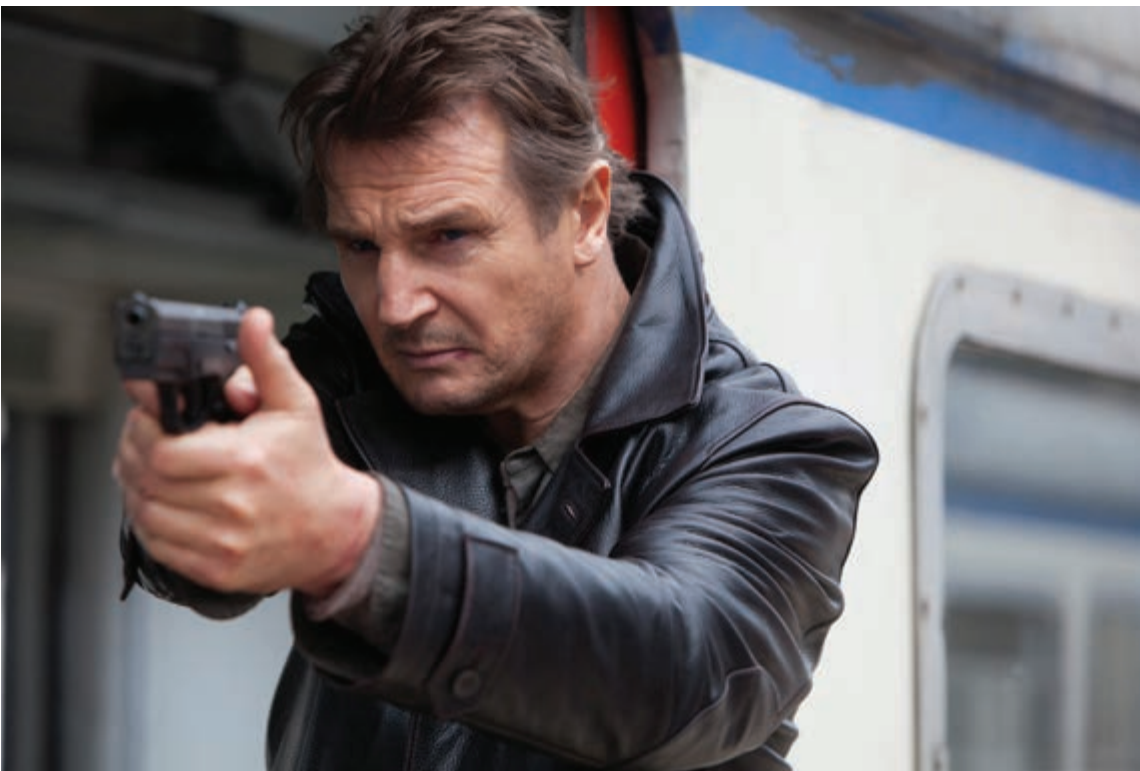
Liam Neeson making a serious face during the shooting of Taken 3.

beginning to fall for Bryan all over again but is told by Bryan that she should go home and work out her marriage before trying to pursue him. The following day, Lenore texted Bryan asking if they could meet at his place for bagels. After approving the request, Bryan went to the local bagel shop and bought everything he needed for the meeting at his place. Bryan reached home and realized something wasn't right. Before reaching his bedroom he stumbles upon a bloody knife lying on the floor. Confused as can be, Bryan opens his bedroom door and finds Lenore dead, with her throat sliced. LAPD was already phoned by Lenore before she died, but when they finally arrived at the crime scene, it was framed as if Bryan killed her. Bryan was about to be arrested but before the handcuffs could be slapped on his wrists, he managed to escape and he sets out to discover who really killed Lenore. For the time being, Inspector Franck Dotzler (Forest Whitaker), sets up a manhunt to apprehend Bryan. Bryan could have enjoyed life in Los Angeles with a granddaughter on the way,