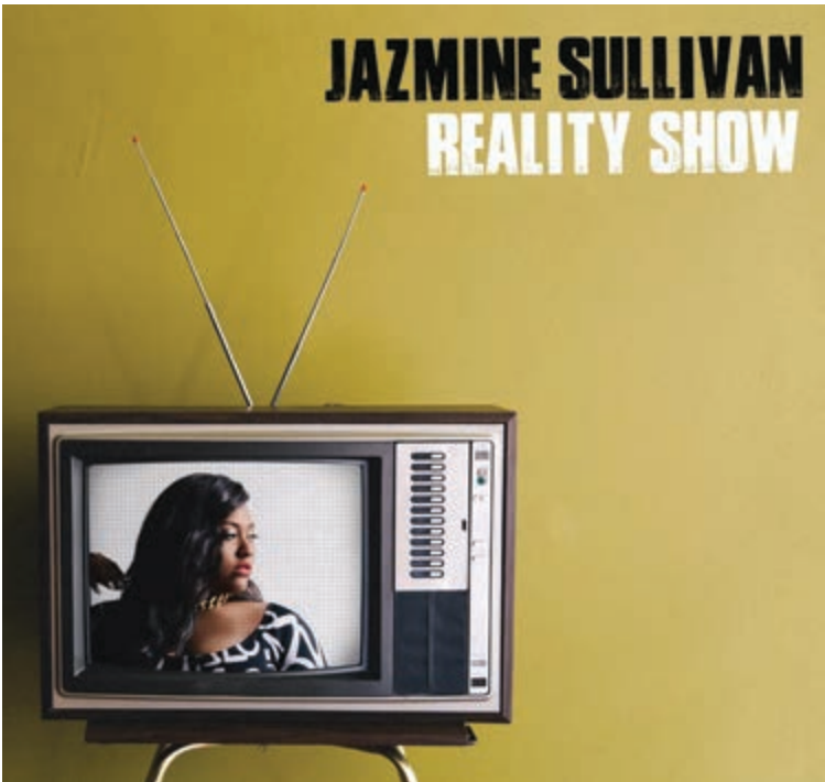
Jazmine Sullivan's newest album.

display the richness and power in Sullivan's voice with a heavy bass line and throw back to the 60's. On the opposite side of the spectrum Sullivan's range is displayed prominently on the heavy disco inspired track, "Stanley." Produced by Da Internz, "Stanley" compliments Sullivan's heavy rasps and vocal range without over shadowing her with its strong sequencers and bass. Although it is a great album as a whole, Reality Show is not without its hiccups. The lead single and first track, "Dumb" (produced by Salaam Remi and Key Wayne) is a return to Sullivan's former