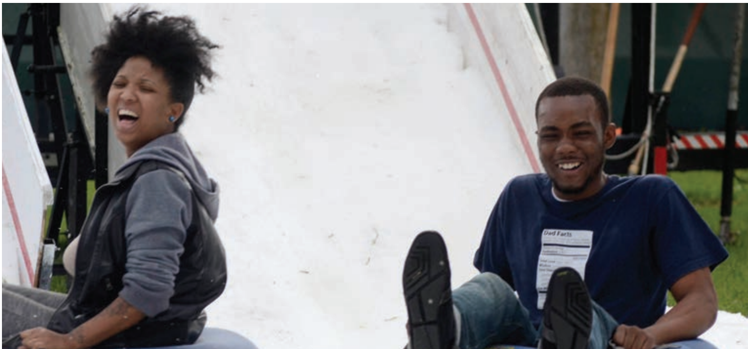
Broward College students slide down the snow slide on intertubes during snow day on South Campus.